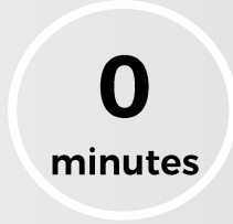
Client time to compile rules for invoice extraction